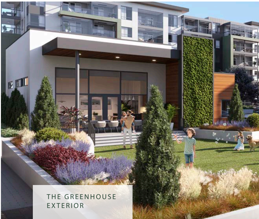
THE GREENHOUSE EXTERIOR