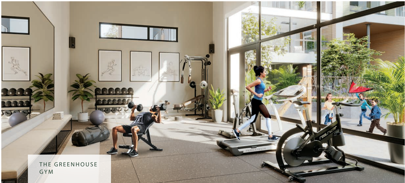
THE GREENHOUSE GYM