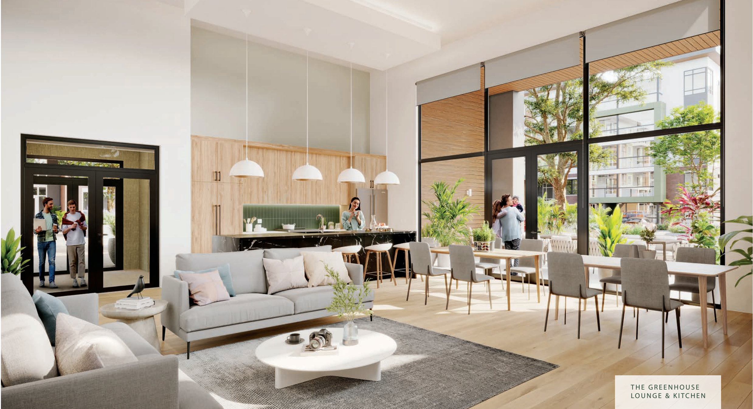
THE GREENHOUSE LOUNGE & KITCHEN

Adjacent to the lounge, the private gym amenity awaits—a haven for health enthusiasts. Equipped with a range of weights and cardio equipment, mat space for yoga, and a water fountain, this fitness area invites residents to pursue their fitness goals.